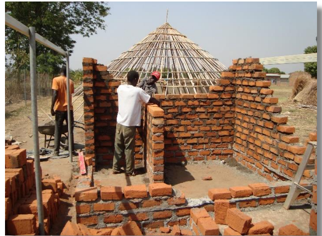
Local Masons building the “Tukul” and Pit Latrine / Bathing facility