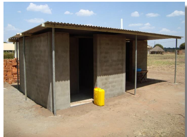
Pit Latrine / Bathing Facility