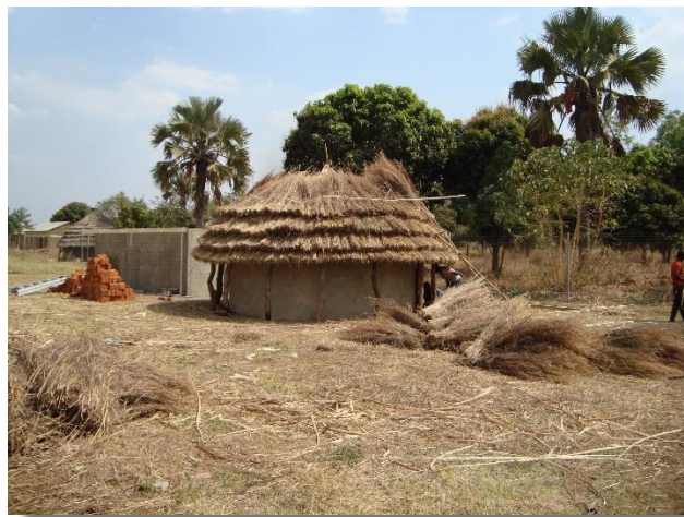
Tukul roof under construction